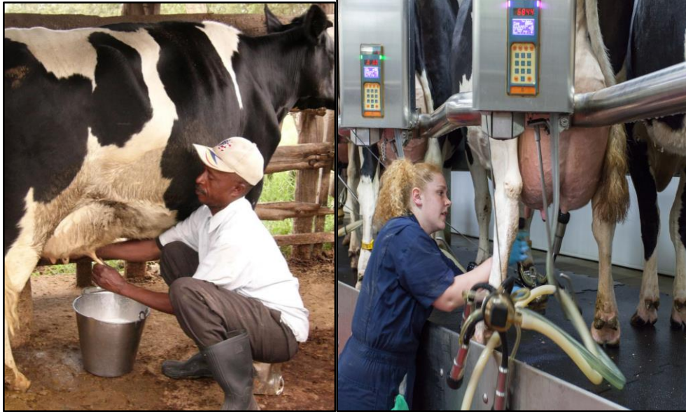
Figure 15. Traditional farm (left) and semi-technological farm (right) (Department of Dairy Science, n.d.; The Organic Farmer, 2015)