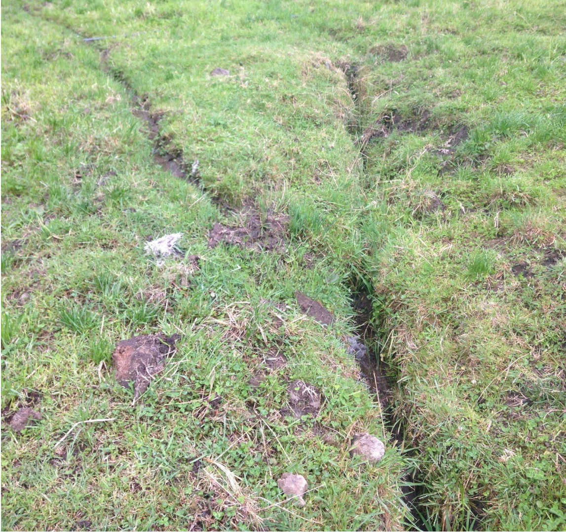
Figure 7. Farmer 3: Man-made channels that run through the pasture and carry the produced wastewater into the Yanuncay River