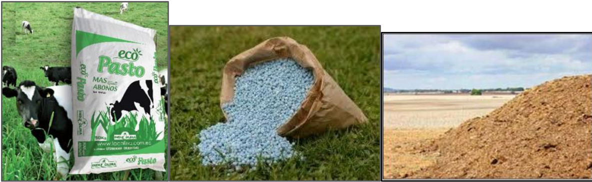
Figure 14. Mixed fertilizer, chemical fertilizer, and gallinaza (Salmanova, 2017; Intagri, n.d.; Getty Images, 2012)