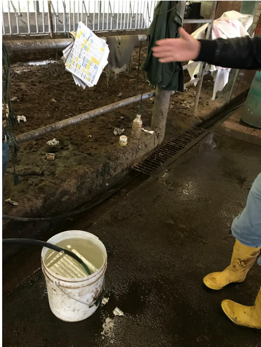
Figure 5. Farmer 2: Man-made channel where manure is shoveled and hosed into after the milking process; this channel leads into natural channels (shown in Figure 6) which eventually flow into the Tomebamba River