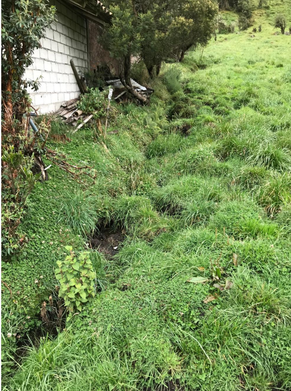
Figure 6. Farmer 2: Natural channel that carries the wastewater from the man-made channel (shown in Figure 5) to the Tomebamba River