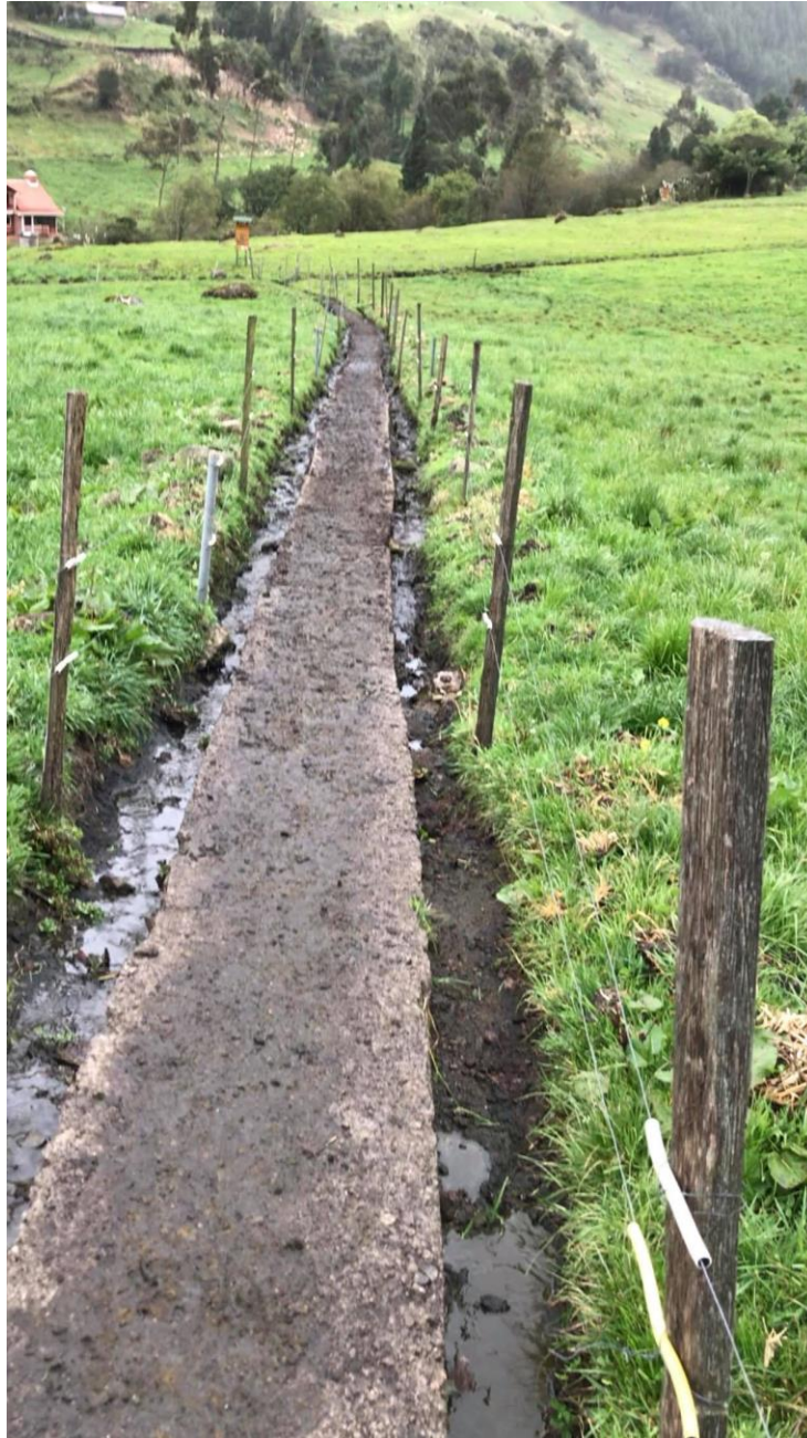
Figure 9. Farmer 4: The produced wastewater from the hosing process (shown in Figure 8) running into channels that lead into the Yanuncay River