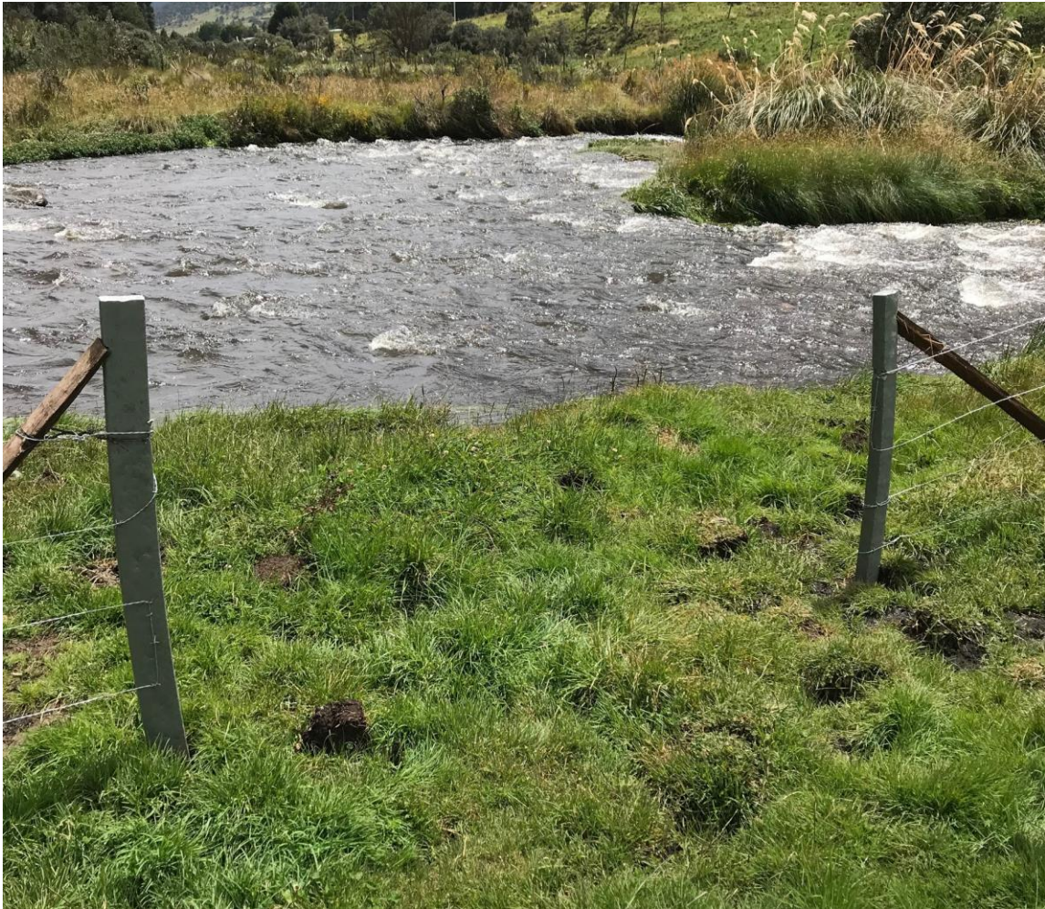
Figure 3. Farmer 1: Break in the fence that allows cows to drink from the Tomebamba River and contaminate it