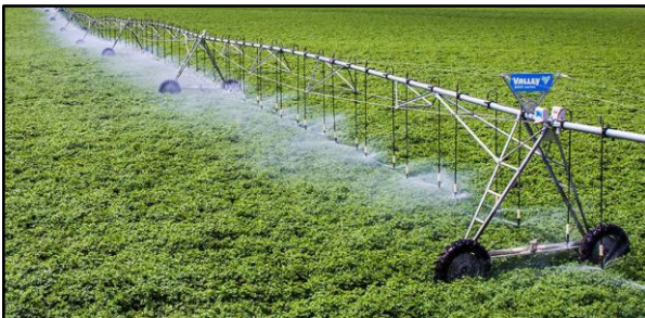
Figure 12. Irrigation system (Southwest Irrigation, n.d.)