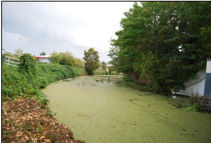
Figure 16. Eutrophic river caused from agricultural runoff (Chadwick, 2012)