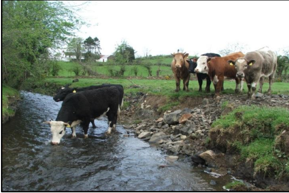
Figure 10. Cows drinking from river (Swan, n.d)