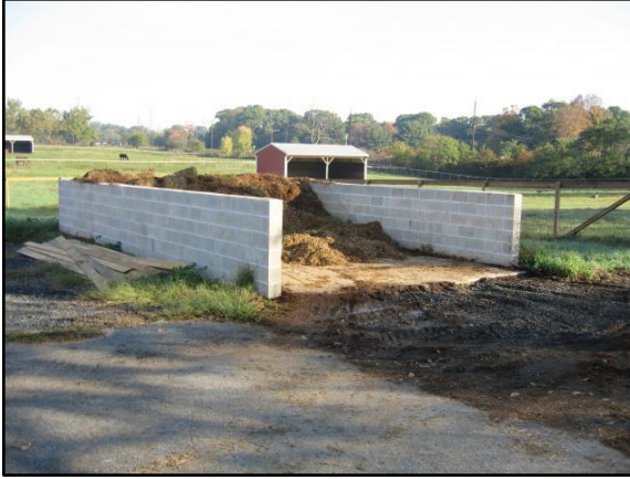
Figure 13. Manure storage system (Rutgers, 2018)