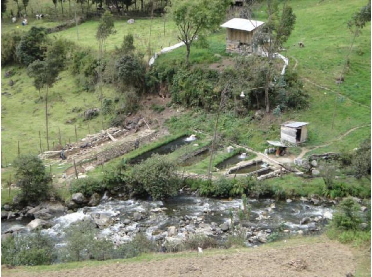
Figure 4. Farmer 1: Water tanks used to raise trout lack adequate filtration systems, allowing wastewater from the tanks to flow into the Tomebamba River