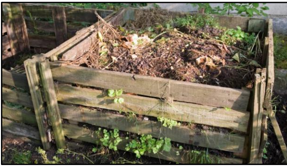
Figure 11. Compost pile (Gifford, n.d.)