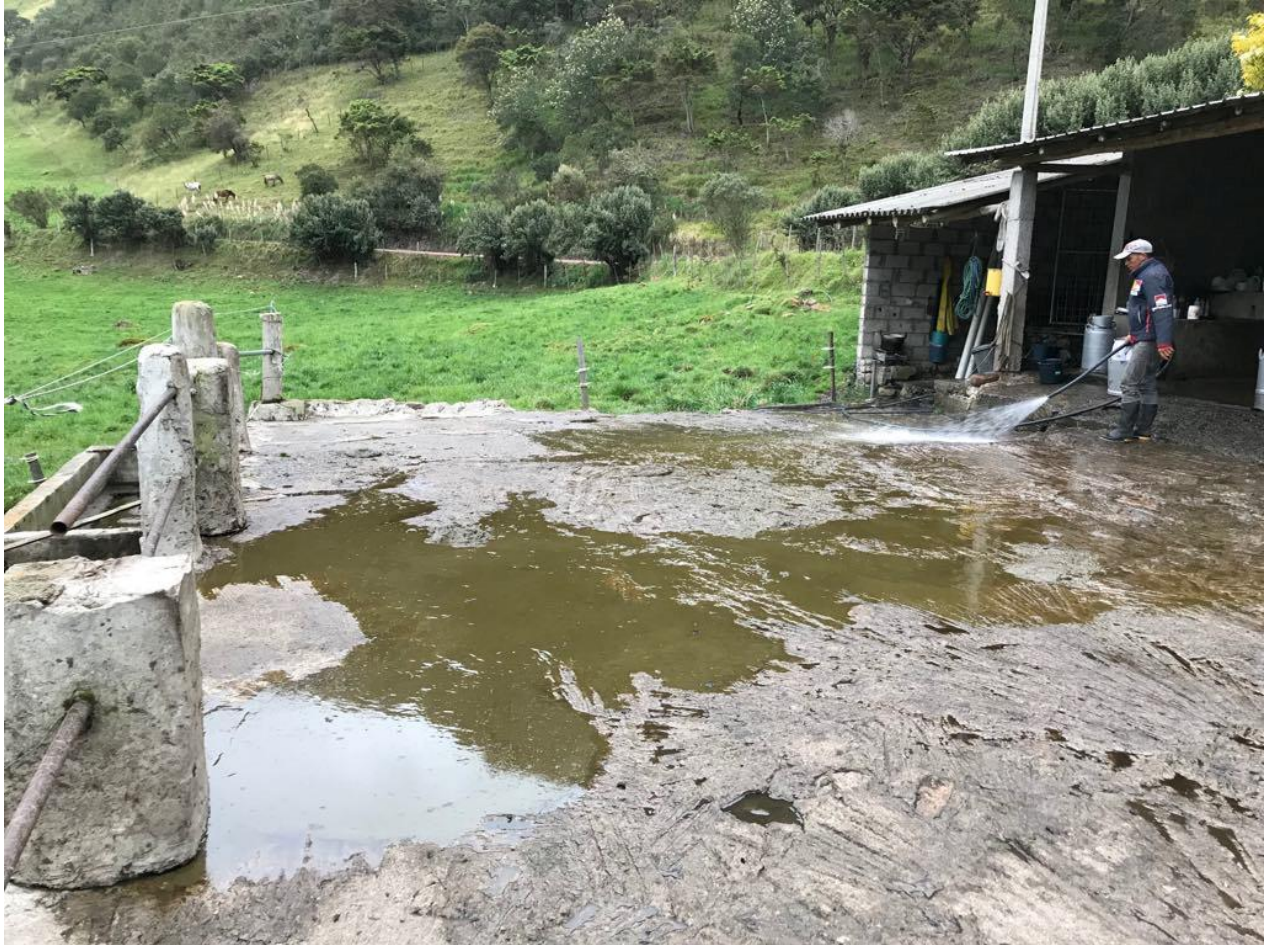
Figure 8. Farmer 4: The spraying of cow manure after the milking process which produces wastewater that eventually flows into channels (shown in Figure 9) that enter the Yanuncay River