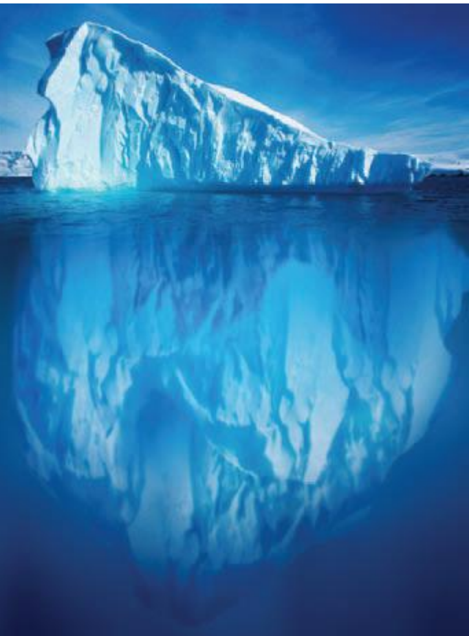
Figure 2-1: The Iceberg Phenomenon

These statistics cry for action. More and more youth become neglected by parents. In the home, they are bombarded by abuse both in person, and online. But, just as only 10% of an iceberg is visible above the surface of the water (see Figure 2-1), so it is with youth. Often times the warning signs are only the start of the problem. If a child resorts to alcohol abuse at an early age, there could very well be an underlying problem that goes beyond the drinking. The problem most likely originates from one of the