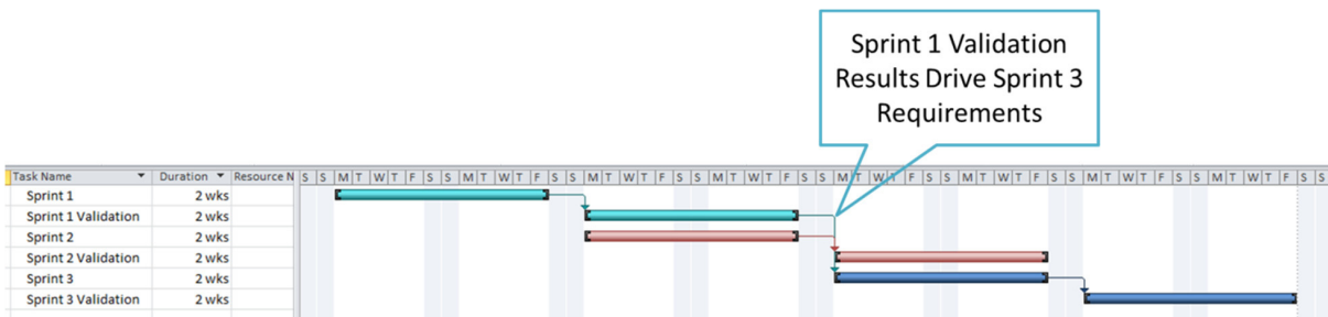
Figure 3 – A subset (three sprints) of the Milestone 3 schedule, including validation periods and how they overlap. The validation results from Sprint 1 feed directly into the Sprint 3 process, enabling rapid adjustment in response to user feedback.

In addition to the change in scheduling, the team made always having a system available for use a high priority. During prior milestone periods, the system had not reached a sufficient level of stability that warranted dedication of hardware for validation – at the expense of hardware available for integration and test. By making such a change for this milestone, we allowed validation to occur on a release right after it went through integration and test.