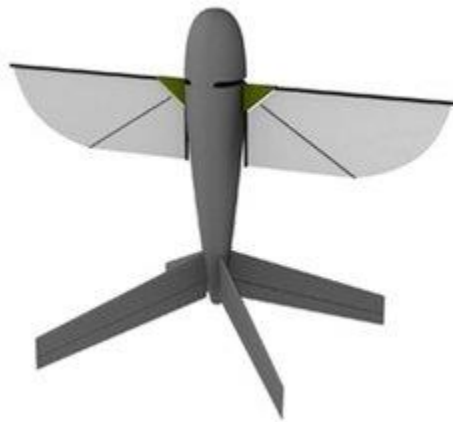
Smallest UAV (Covert, 2008)