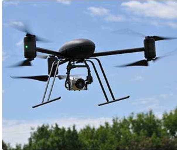
Draganflyer X-6 (RCReview, 2011)