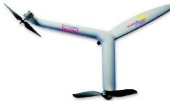
Phantom Sentinel, the only known spinning RPA (Mraz, 2006)