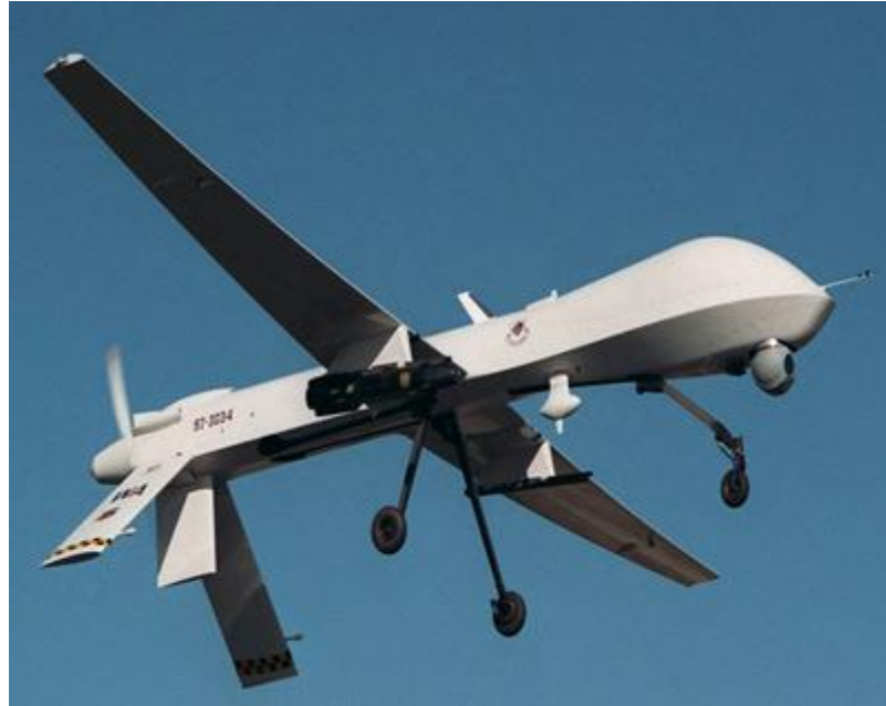
MQ-1 Predator Drone, the world's most famous drone (Valdes, 2004)