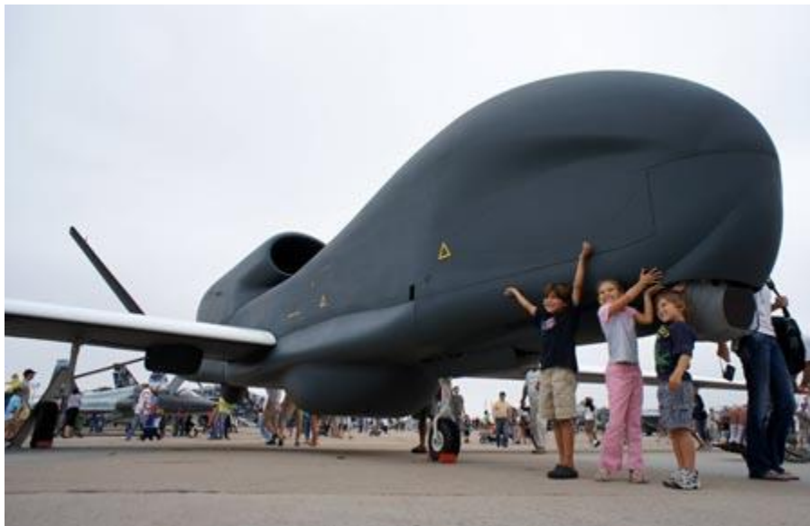
Global Hawk, The World's Largest UAV