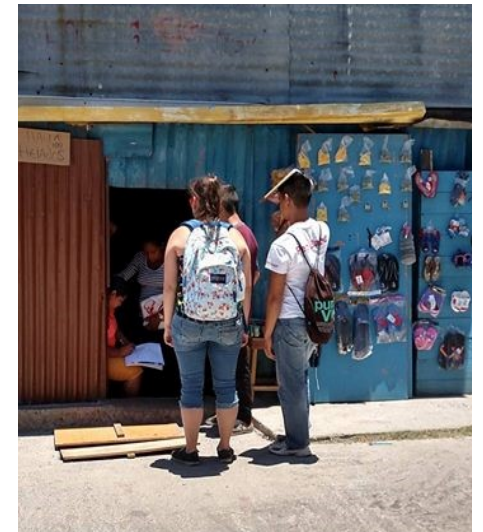
Surveying in La Carpio

Community Engagement: We learned that a considerable amount of people in San José are interested in helping maintain the routes and would like to use them for cultural expression. This interest could encourage individuals to become involved with the work of existing community organizations. Additionally, the proposed routes would