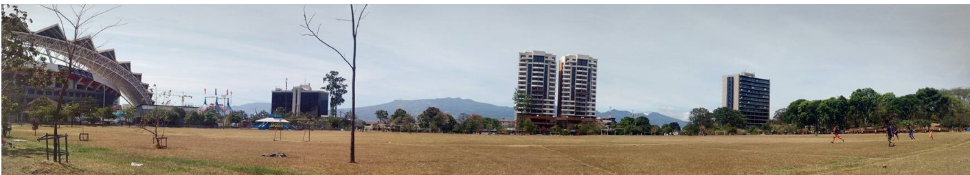
Parque La Sabana

vide safer routes for these activities, which is important since one in three people in San José do not use bicycles to get to work because they believe the current infrastructure is unsafe (Encuesta, 2015). The implementation of nature-urban routes to connect green spaces and encourage physical activity could drastically change the state of the city.