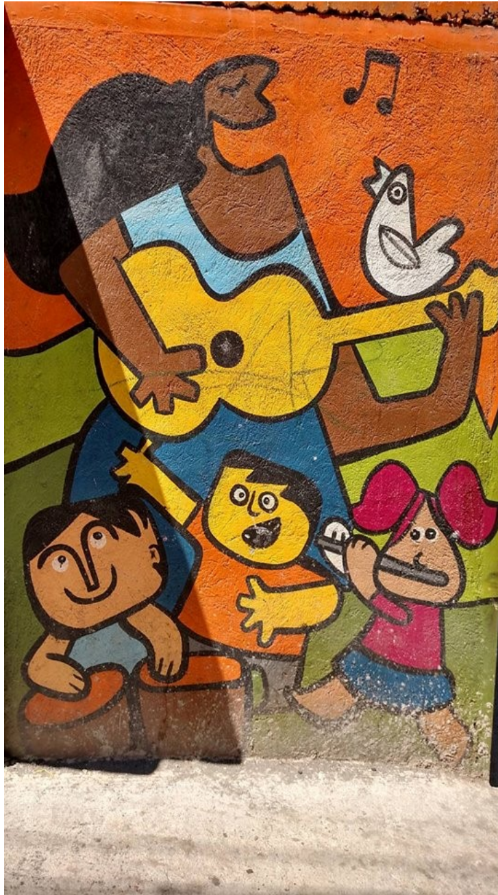
Mural in La Carpio