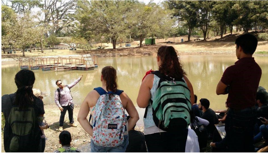
Tour of the María Aguilar river basin

Improving the city's access to nature could positively affect its economy by creating opportunities for urban ecotourism. Ecotourism is an important source of revenue for Costa Rica. Tourists are typically interested in the country's biodiversity, which accounts for 4% of the entire world's biodiversity