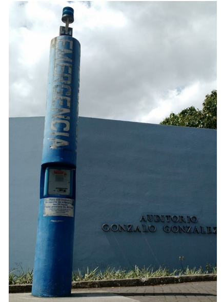
Emergency Call Box