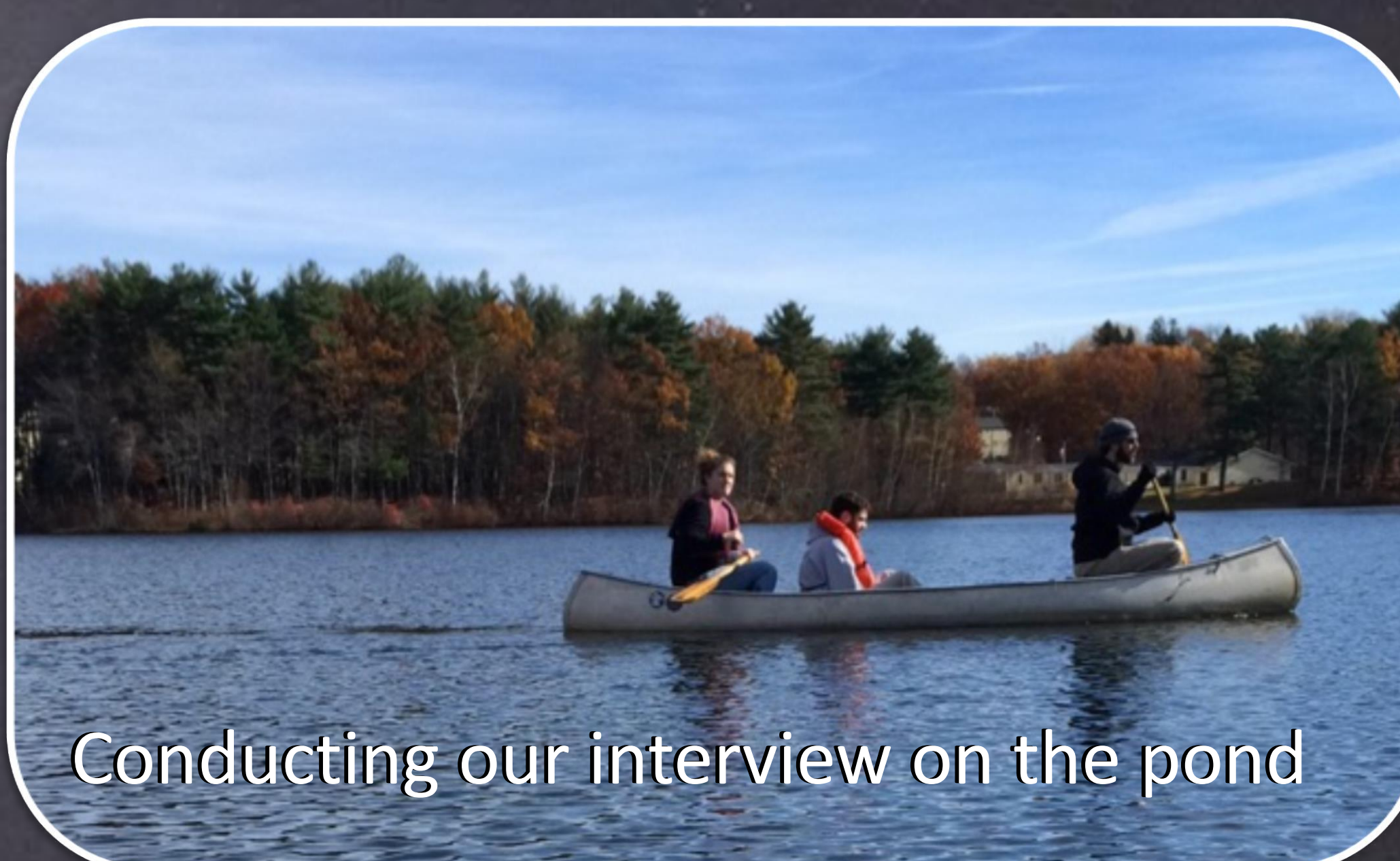
Conducting our interview on the pond