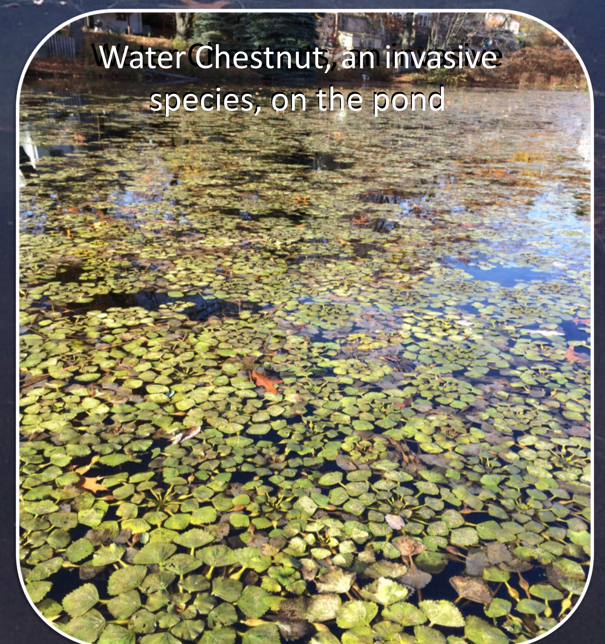
Water Chestnut, an invasive species, on the pond