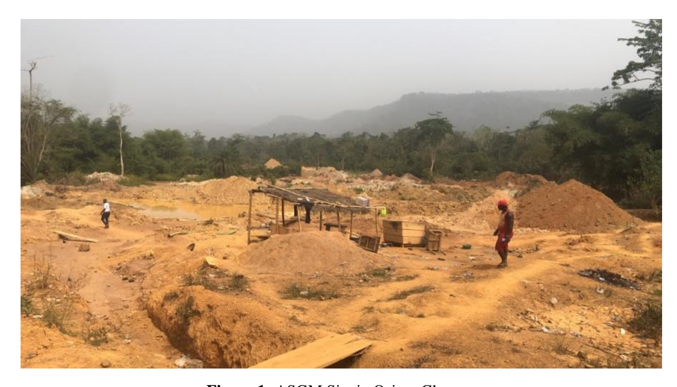
Figure 1: ASGM Site in Osino, Ghana

The artisanal small scale miners (ASM) work on sites that were once owned and operated by the large scale mining. The left behind sites look like the one in Figure 1.