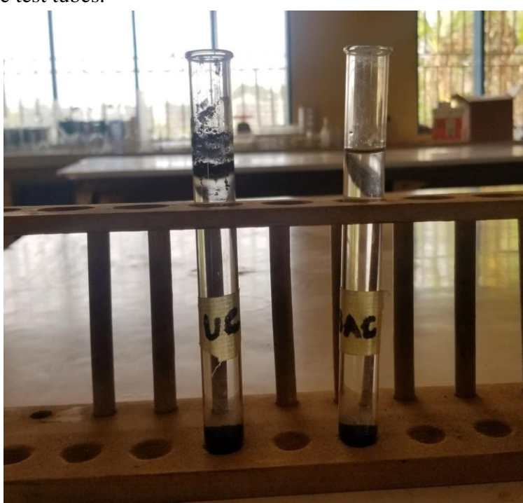
Figure 2: Images of test tubes containing UC on the left and B¹BAC on the right on Day 5

In this test, we started our experiment with a burgundy-colored solution in our test tubes which was attributed to the 4mg/ ml iodine solution (with alcohol) in them. As time progresses, the burgundy color will start to fade away which indicates the adsorption of iodine solution by the carbon. During our preliminary visual iodine test analysis, we noticed that the unactivated carbon would start clearing up faster than the activated carbons. Soon, the pace would be reversed and the activated carbons would clear up faster. Unlike activated carbons, unactivated carbon was noticed to float on the top of the test tubes.