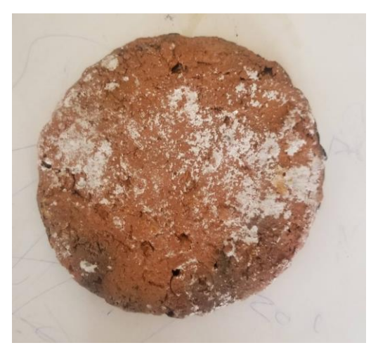
Figure 4: Clay-Sawdust Filter Made from 1:1 Ratio of Clay and Sawdust After Being Fired

Water was able to pass through this filter and even collect some sediment from the water. The other two ratios did not work out. The filter that was made with 20% clay and 80% sawdust was extremely difficult to mold and it fell apart soon after being submerged in water. The 40/60 filter could withstand a little more pressure as compared to the 20.80 filters, although it did not do better than the 50/50 filter. One of the greatest challenges that came with creating the clay-sawdust filter was the lack of a kiln. In order for clay to be fired properly, it needs to experience extreme heat for a long period of time. First, we attempted to locate a kiln. The nearest kiln was more than two hours away and would not be easily accessible to the local community of Kyebi. As a result, we attempted various firing methods. The firing method that was most successful was placing the clay-sawdust filters in an LPG oven for several hours. This testing was extremely preliminary, but it allows us to understand what processes can be used to create the filter.