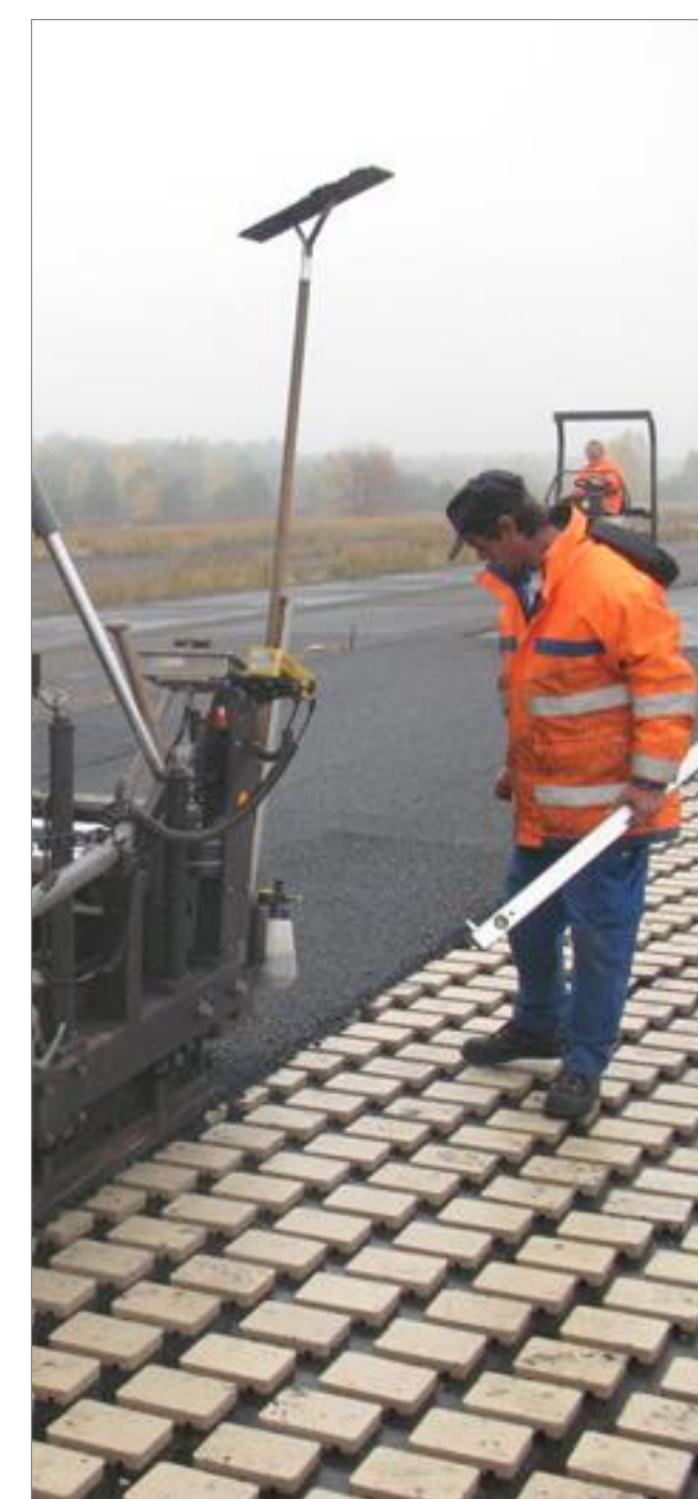
Laying buried resonators