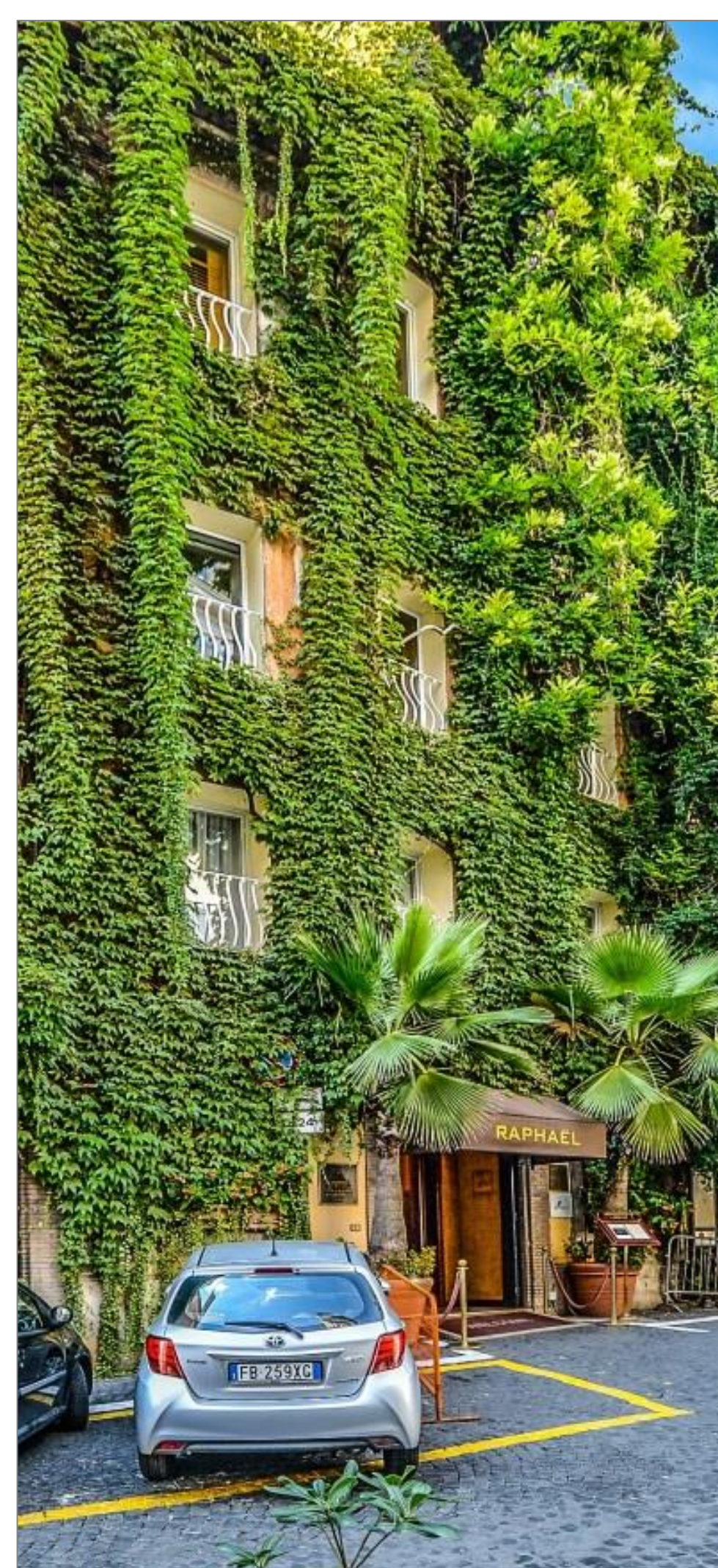
A green facade