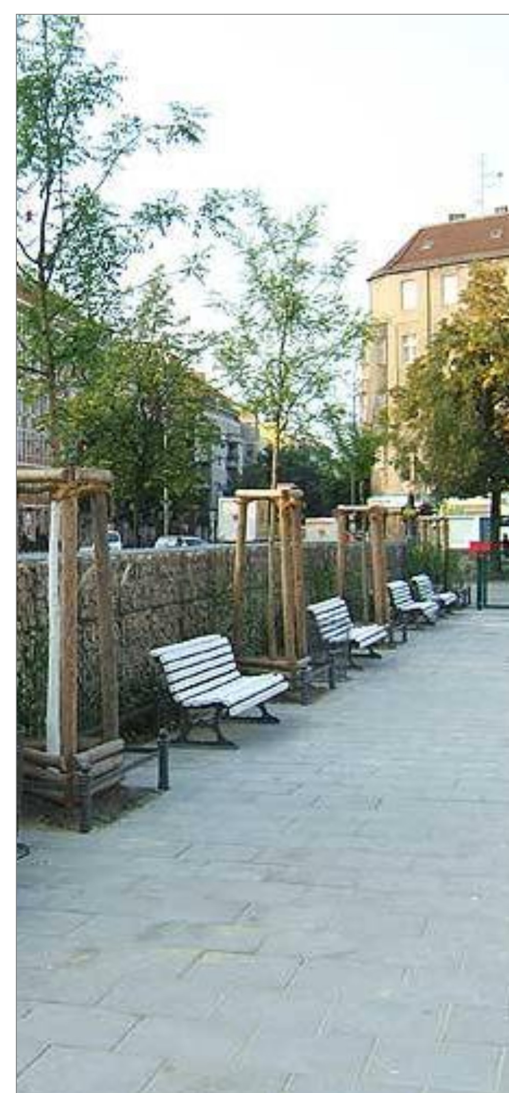
A low gabion wall