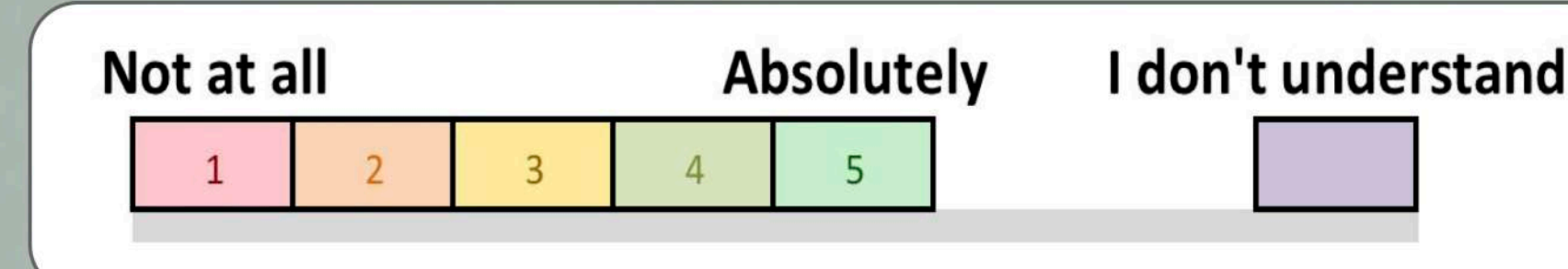
The Likert Scale from the student survey