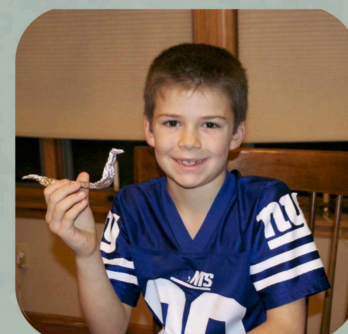
An example of an activity called "Foil Creatures"