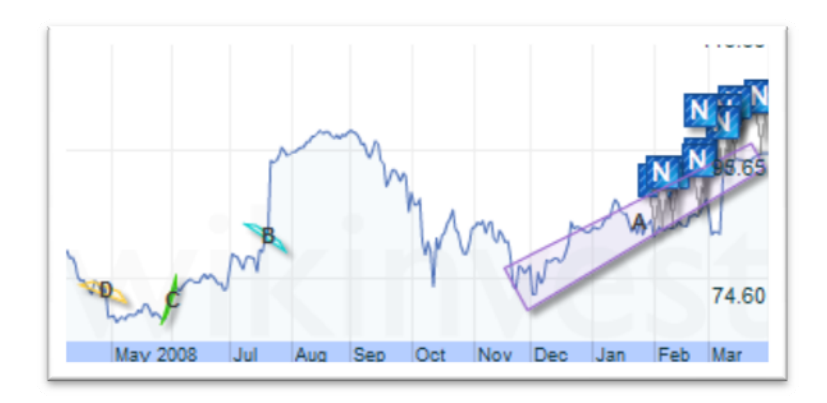
Figure 5.1: Stock Prices in US Dollars over Time in Months from May 2008 to March 2008.

Genentech is another biopharmacutical company. Its recent, rapid growth has been extremely profitable for investors: annual revenue grew by 77 percent in two years, from $6.6 billion in 2005 to $11.7 billion in 2007. In the graph below, one can observe a drastic 30% increase in stock prices in just four months, following the release of a study which proved that a Genentech's drug, Avastin, decreases mortality rates in breast cancer patients.