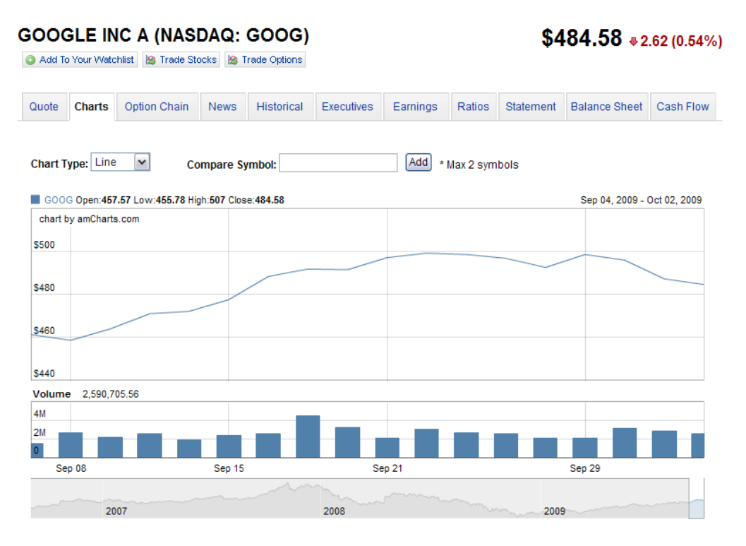
Figure 7.2: Monthly performance of Google (SEP-OCT)