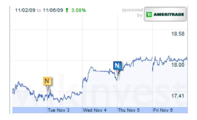
Figure 4.2. SEIC Stock Chart for Week of Nov. 2 - Nov. 6, 2009

I elected to sell some of my TD Ameritrade shares because they have remained relatively stagnant. However, SEI investments has been upgraded from "market perform" to "outperform" by analyst Keefe Bruyette. As can be seen in Figure 4.2, this news prompted a sizeable jump in stock price the following day (the time of this market valuation is highlighted in gold). On hopes of SEIC shares reaching their target price of $22 per share, I chose again to purchase shares in SEI Investments.