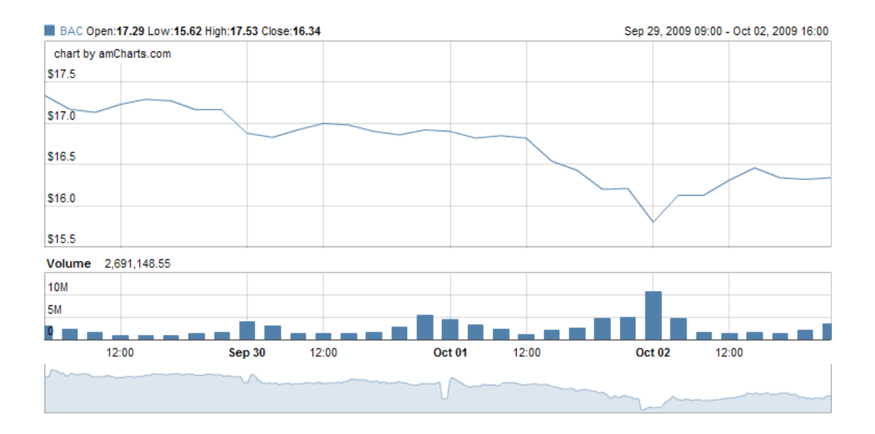
Figure 4.1. BAC Stock Chart for Week of Sept. 29 - Oct 2, 2009

The increase in BAC's share value Friday was a result of the bank's board authorizing a dividend payment on preferred stocks issued to the Treasury Department last year as part of the bank's rescue plan, signaling the bank's ability to repay its TARP loans.