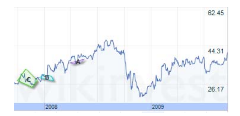
Figure 5.2: Stock Performance of Illumina

heavily on government grants, and the government itself. The amount of grants offered from government sources decreased during that time. However, this stock has been on the rise since November of 2008, so now may be a good time to buy. This information is represented graphically below: