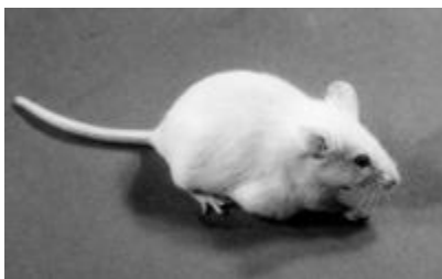
Figure-1: Photograph of Oncomouse. This figure shows one of the later versions of the cancer-prone mouse, in this case the mouse contains the ras oncogene which makes it prone to developing cancer. (Bioethics and Patent Law, 2006)

The Oncomouse was one of the earlier transgenic animals created ( Figure-1 ). In the 1980s, Harvard University created a mouse that was highly vulnerable to cancer by introducing a myc oncogene that triggered the growth of tumors (Stewart et al., 1984; Bioethics and Patent Law, 2006). The myc oncogene was placed under the control of a mouse mammary tumor promoter to express the oncogene in mammary tissues. So this initial version of oncomouse served as a model for mammary tumors. This cancer-prone mouse allowed for greater research into the initiation of cancer, and a model for screening potential anti-cancer drugs. Other later versions of the mouse carry the ras oncogene (Anderson, 1988).