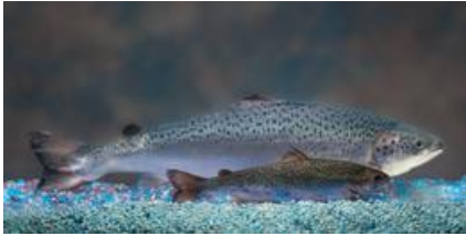
Figure-2: Superfish. Photograph of transgenic fish that grow twice as fast as wild type Salmon. (Marris, 2010)

introducing these massive salmon into the ecosystem is still unknown (Stokstad, 2002; Clarren, 2003).