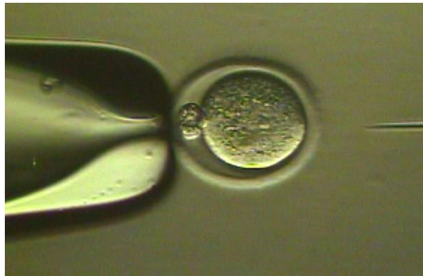
Figure-1: Photograph of DNA Microinjection into a Pronucleus to Create a Transgenic Animal. The photograph shows a newly fertilized egg (diagram center) held in place by a suction pipette (diagram left), while a very fine needle is used to inject a solution containing DNA for insertion into the animal (diagram right). (Mullin, 2010).

The injected embryos are grown in vitro for about 5 days, until they are in the blastocyst stage of development. A blastocyst is a hollow sphere made of an outer trophoblast and an inner cell mass. The blastocyst is then implanted into the uterus of a pseudopregnant female where it grows to maturity (Brinster et al., 1985). Female mice are induced into a pseudopregnant state by mating them with a sterile male. This causes a hormonal change that allows the uterus to accept the implanted blastocyst. It is estimated that less than one third of the implanted blastocysts will mature into healthy offspring. The main advantage of the pronuclear injection technique for making a transgenic animal is it is somewhat reliable and applicable to many animal species. Its main disadvantage, discussed extensively in Chapter-3 on ethics, is the transgene inserts randomly into the animal's DNA, which can destroy a useful host gene or activate an oncogene causing cancer.