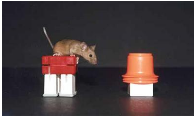
Figure-3: Photograph of Doogie the Smartmouse. This mouse shows better memory than normal mice. (Orca, 2009)

when tested against a control group, showed a huge increase in both memory duration and quickness in learning ( Figure-3 ). The expression of this gene could prove valuable in human memory and its dwindling nature with age (Harmon, 1999).