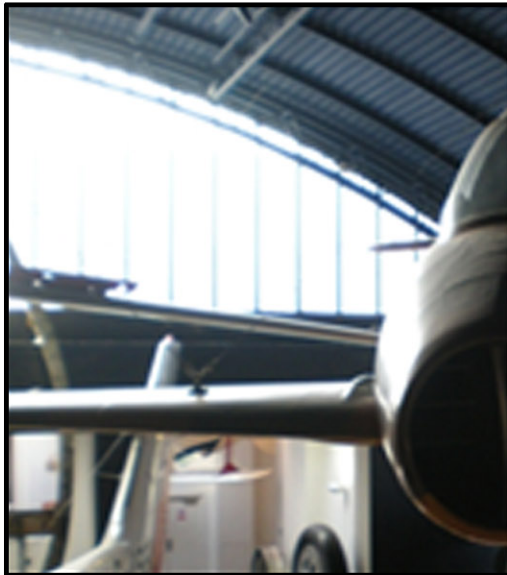
Gloster E.28/39, 1941

What was so special about this aircraft's engine?