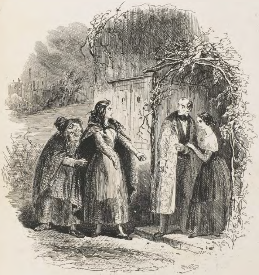
The rejected alms.