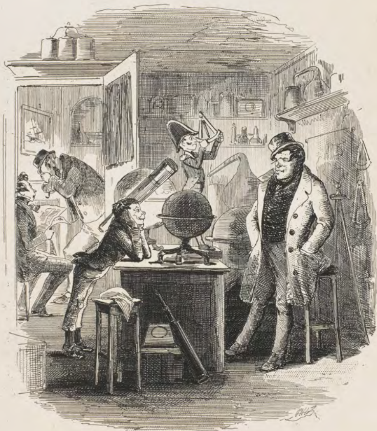
A Visitor of distinction.