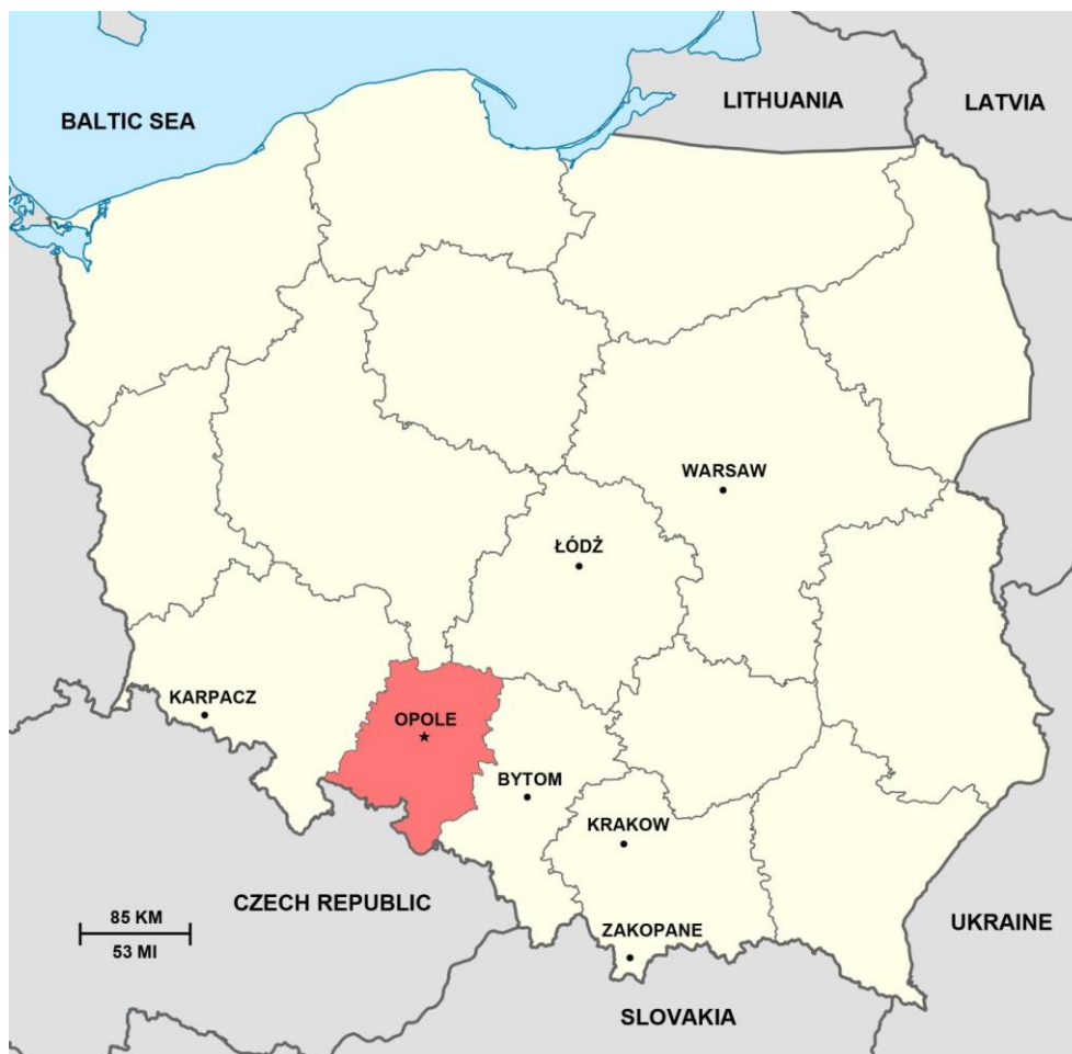
Figure 2: Map of Poland, present-day

father was the “only good thing about communism.” Employees would receive a whole month of vacation days per year: twenty-six days plus four Sundays. While two of those weeks could be used for miscellaneous vacation days, the other two weeks could be used towards discounted trips within the Eastern Bloc, including East Germany. My parents took advantage of this opportunity by visiting the mountain resorts Zakopane and Karpacz, in addition to the Baltic Sea and Bulgaria (refer to figure 2 for all locations identified in this report). By offering discounted vacations to the Polish people, the Communist party kept the people not only happy, but united. Citizens living in communist countries were only allowed to visit other countries in the Eastern Bloc, which prevented people from leaving Soviet-influenced territory, and created a strong bond