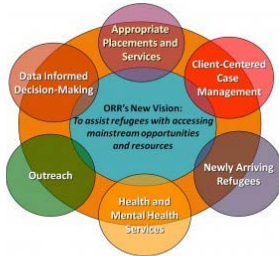
Figure 1 Office of Refugee Resettlement

As figure 1 shows, the Office of Refugee Resettlement feels that there are many factors impacting refugee life. These factors, such as health and mental health services, the ability to make informed decisions, and case management, all affect the ability of the individual to access mainstream opportunities and resources. While the Office of Refugee Resettlement coordinates and organizes efforts, the direct work is done by the affiliates of the RAs. These affiliates meet refugee clients at the airport, move them into their first apartment, and begin to guide them through the bureaucracy of federal, state, and local requirements ("Refugee Admissions Reception and Placement Program," 2011). They also facilitate the provision of critical services if the agency does not provide these services themselves. This tiered responsibility and oversight creates a specialized service delivery model. This means that as social service providers receive funding for executing specific programs and services, the program becomes the focus instead of the client.