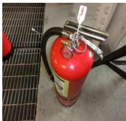
Figure 7: BullEx Smart Extinguisher filled and ready for use.

BullEx Smart Extinguishers mimic actual fire extinguishers in their size, shape, and weight. Most fire extinguishers can be described as metal cylinders filled with an agent to be deployed at high pressure on a fire. The agent is deployed from the extinguisher by the depression of the lever, allowing the pressurized air and water to escape (13).