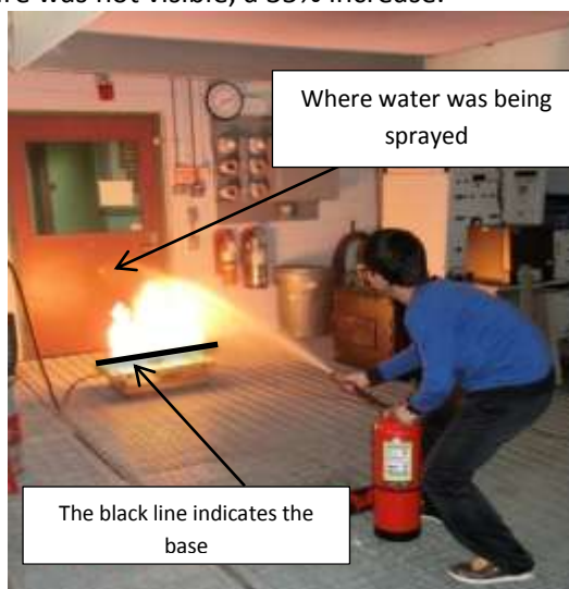
Figure 9: Participant aiming above the base of the BullEx ITS

Table 6, Percent Improvement of Technique in Handling a Fire Extinguisher, shows the percentage improvement from Trial 1 to Trial 2. Overall, 276 participants improved their ability to aim at the base of the fire by 21%, so 93% aimed at the base. Participants improved their ability to use the proper sweep technique by 22%, so 96% used the sweeping back-and-forth motion. Finally, 83% of participants continued to spray after the fire was not visible, a 35% increase.