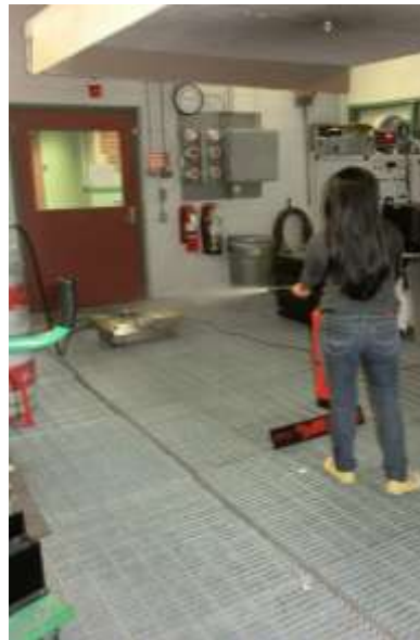
Figure 14: Participant continuously deploys agent on propane fire, thereby preventing re-ignition

Figures 12 and 13 shows a participant extinguishing the fire but not continuing to deploy agent. The fire re-ignites in Figure 13 as the participant begins to turn away from the fire.