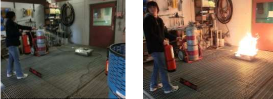
Figure 12 and 13: Participant is not continuously deploying agent

Figures 12 and 13 shows a participant extinguishing the fire but not continuing to deploy agent. The fire re-ignites in Figure 13 as the participant begins to turn away from the fire.