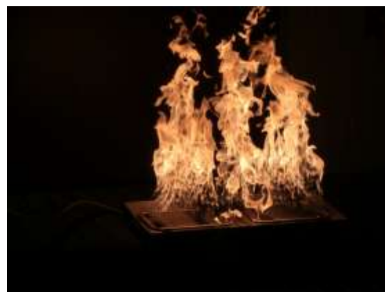
Figure 6: BullEx ITS Activated

The Bull-Ex ITS consists of four parts: the unit, a propane fuel source, an electrical source, and a controller. The unit is 28 3/4" x 18" x 13", is made out of stainless steel, and has four 40 kHz ultrasonic sensors on the front. (16) Fueled by a conventional 20-lb. propane tank, the system produces 500,000 Btu/h. (16) The entire system is powered by a 12V DC battery pack that draws up to 6 amps. The final part of the unit, the controller, controls the fire. (16) The controller has settings for a Class A, B, or C fire. For each setting, the fire can be assigned a difficulty ranging from 1 to 4, with 1 being the easiest and 4 the hardest. (16)