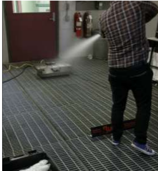
Figure 10: Participant aiming at the base of the BullEx ITS

Figure 9 shows the participant incorrectly aiming at the top of the flames. The compressed air and water mixture was deployed to the top of the flames and sprayed the door instead of the base of the flames. A black line was added to indicate where the base of the flames are.