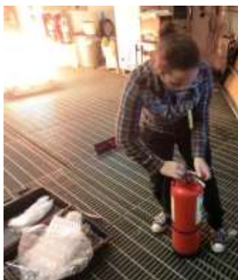
Figure 17: Participant turning back to the fire while attempting to free the pin from the BullEx Smart Extinguisher

Figure 17 shows a participant turning her back to the fire. The participant immediately turned her back to the fire to read the label and then attempted to free the pin from the fire extinguisher.