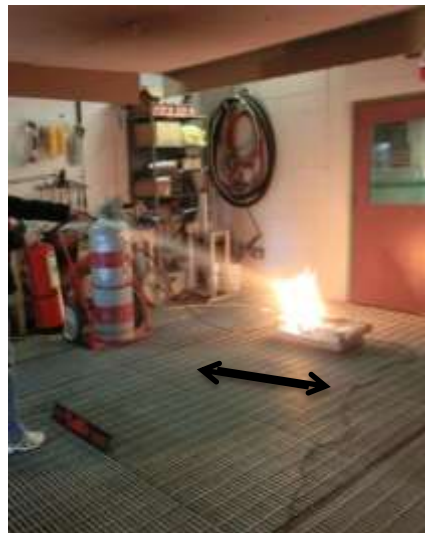
Figure 11: Participant using a sweeping motion to deploy agent on BullEx ITS

Figure 10 shows a participant correctly aiming at the base of the BullEx ITS unit. The participant also used a slow sweeping motion as she aimed at the base of the flames to deploy agent.