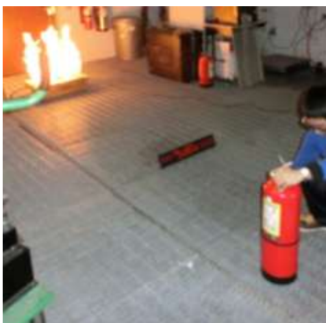
Figure 8: Participant viewing the label on the BullEx Smart Extinguisher while BullEx ITS was active

Table 3, Percent Improvement with Training for Key Milestones of Usage, shows the percentage improvement from Trial 1 to Trial 2 for key milestones of usage. Overall, all 276 participants were able to discharge agent. There was a 46% decrease in discharge agent time. And there was a 20% decrease in reading the label.