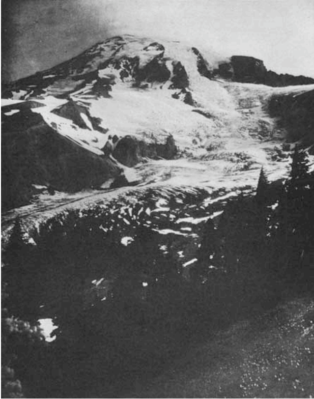
Figure 3 - Image of Nisqually Glacier.

years. As is the case with many glaciers worldwide, both of these glaciers peaked in size since the end of the last Ice Age 10,000 years ago during the “Little Ice Age”, with the Nisqually advancing its furthest in the mid-1820’s (approximately- the Nisqually Glacier was not measured until 1857, at which point it had retreated 300 meters from its furthest point of advance), and the Lyman