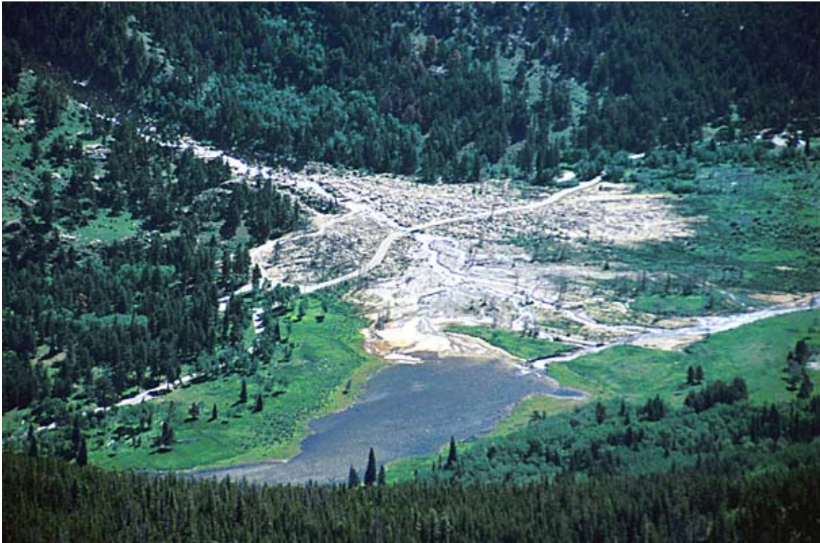
Figure 5- Alluvial fan (debris) left by flood water after the moraine holding back Lawn Lake in the Rocky Mountains burst (July 15, 1982). Some boulders in the alluvial fan are the size of large cars.

Unfortunately, when moraines fail it is rarely a peaceful event, instead creating a flash flood-like scenario, known as a glacial lake outburst flood (GLOF) 30 .