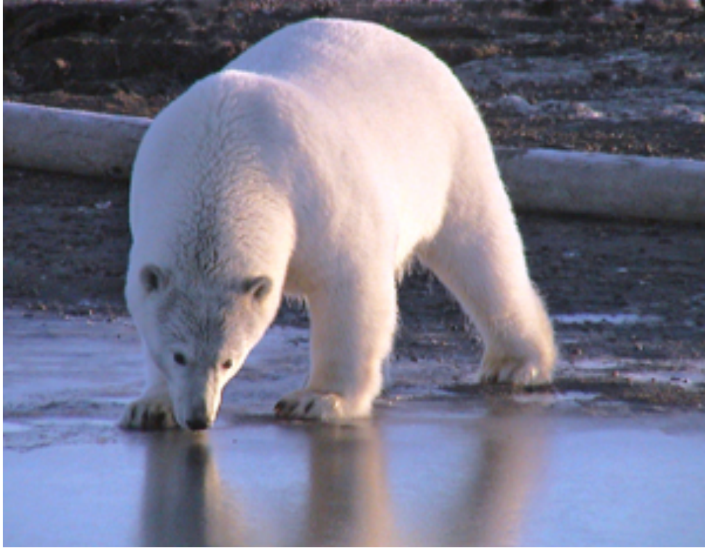
Figure 1- Polar bear yearling.

Those are not the only ice forms that have been melting around the world; many mountain glaciers have disappeared and about 113 glaciers have disappeared from Montana's Glacier National Park. Climate change is not only limited to affecting colder climates, but even the coral reefs are experiencing bleaching, which causes many of these coral reefs to die off 3 .