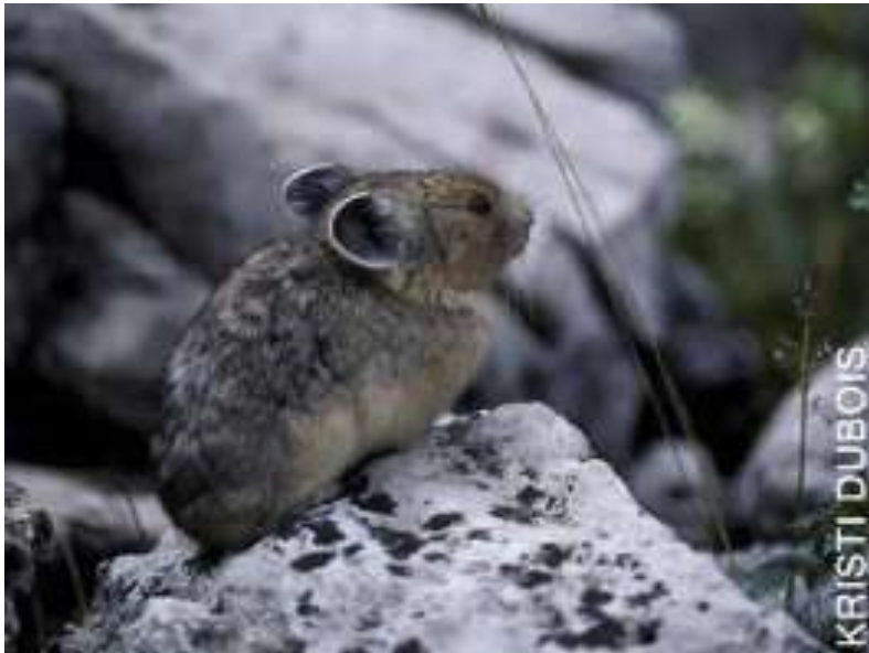
Figure 4- American Pika.

A severe reduction in the size or disappearance altogether of glaciers may have a considerable impact upon those animals that live in the alpine tundra of the Colorado River Basin. It would also substantially affect those animals