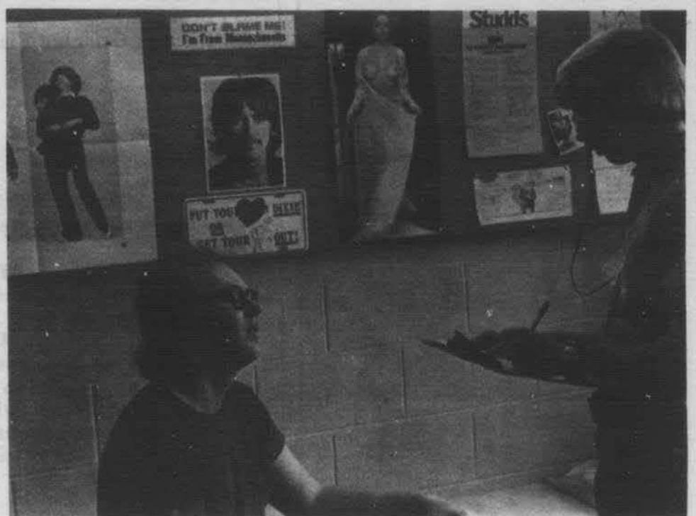
REWARD — $5 for information leading to the capture of these two madmen.