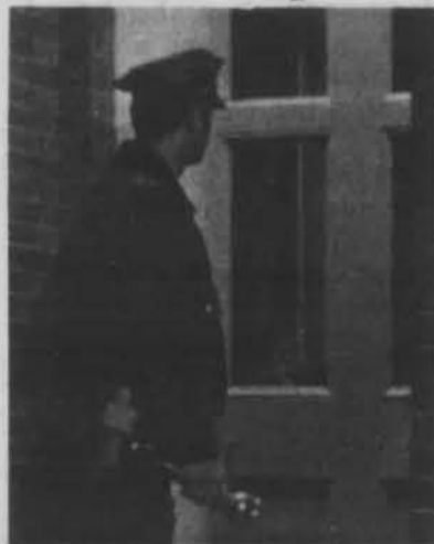
Above, security detail positions itself to cut off escape route.